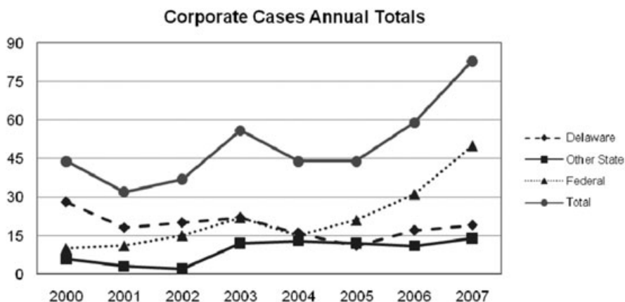
Figure 1: U.S. corporate cases—totals by jurisdiction.

NOTE: Annual number of corporate law cases in database with one or more decisions over 2000–2007, in Delaware state court, other state courts, or federal court. If one case produces several decisions, we use the year of the first decision. Sample = 399 cases. See text for details on search method and sample definition.