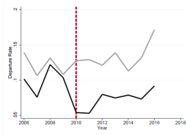
Figure 1: Departure Rates in France

trend, both before and after the quota, until the last year for which we observe arrivals, 2016, when the male departure rate shoots up significantly (2017 is the year when the second stage of the quota became effective).