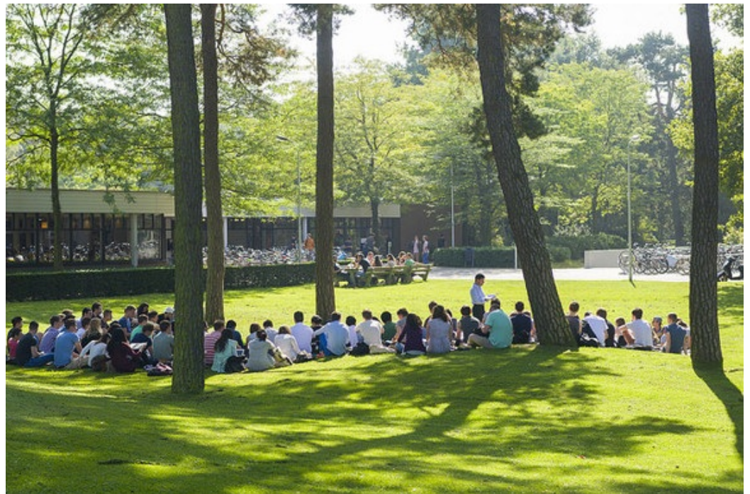
Lecture in the open air on a summer day

Tilburg University has a green campus and is located on the edge of a park-like forest. The campus itself is bustling with student activity, a contrast that makes Tilburg University a truly attractive and dynamic place for learning. Tilburg University has a modern University Library and excellent Sports Center, which are all within easy walking distance from each other. Student work spaces in every building are equipped with all the modern facilities you need to make studying on campus a pleasant experience. Organizations aimed specifically at international students organize all kinds of social activities. All ingredients are there to give you a stimulating, inspiring, and joyful campus experience.