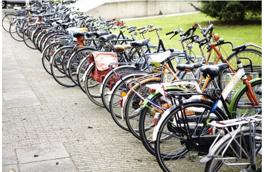
Bikes parked at the Tilburg University campus

Did you know that, for the Dutch, the bicycle is an important means of transport? In the Netherlands, you will see bikes everywhere you go. Going by bike is a fast, easy and safe way to explore the city and its surroundings and to move between the Tilburg city center and the Tilburg University campus.