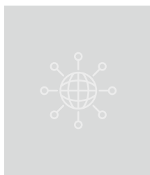
(no Chair) Communications Network