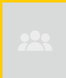
(no Chair) Horizon Europe Task Force