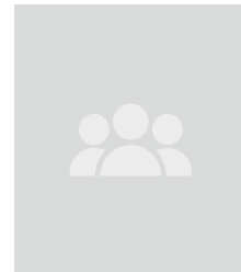
(no Chair) Audit Committee Task Force