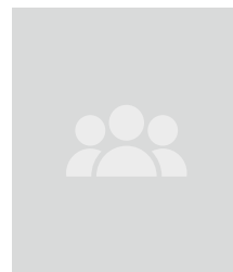
(no Chair) Company Law Task Force